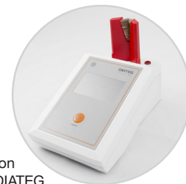
insulation tester DIATEG